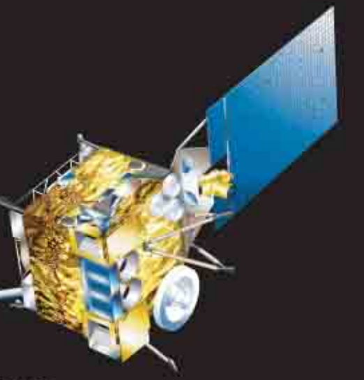
GOES (Geostationary Operational Environmental Satellite)