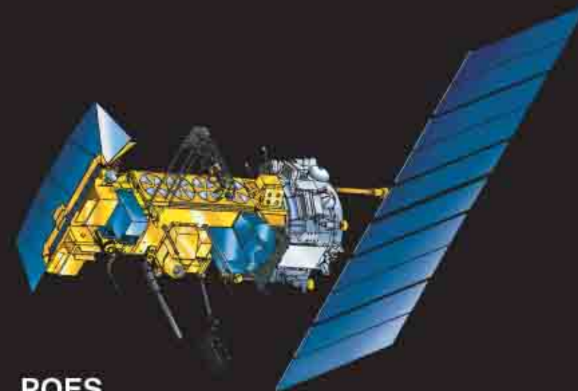
POES (Polar Orbiting Operational Environmental Satellite)